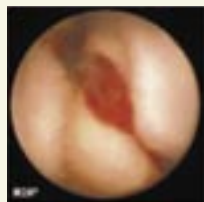
Active duodenal bleeding